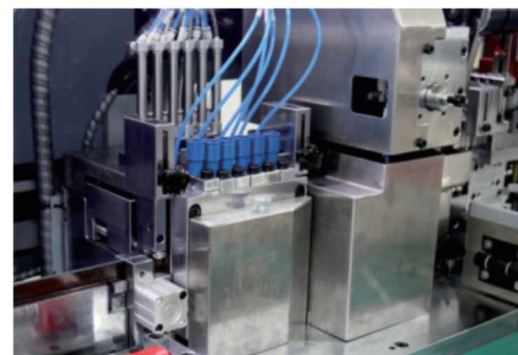
多功能冲切、沉孔、打点 Countersunk Hole,Nicking