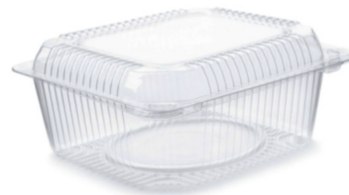
吸塑包装 Thermoformed Package